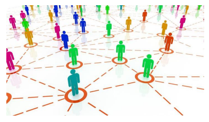
Networking, networking, networking!