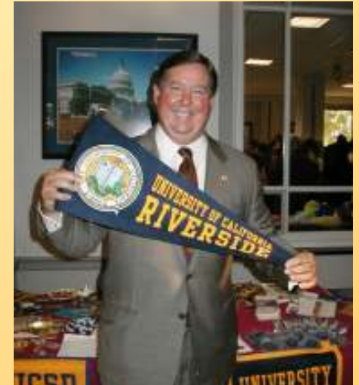
Congressman Ken Calvert